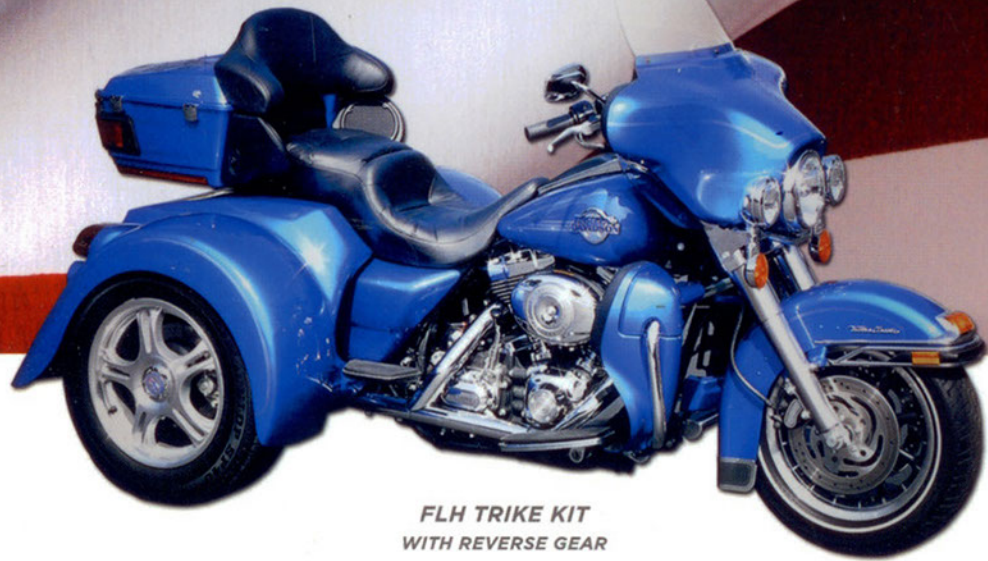
FLH TRIKE KIT WITH REVERSE GEAR