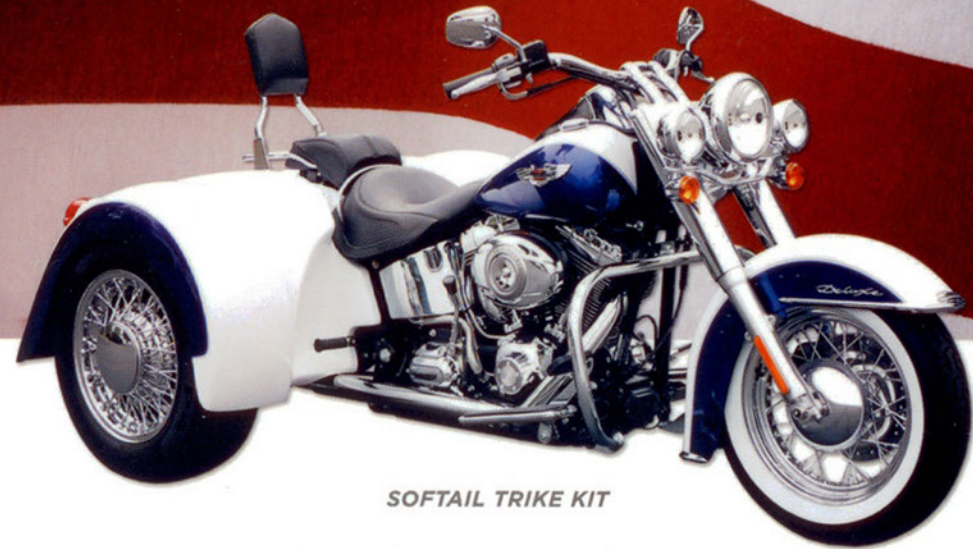
SOFTAIL TRIKE KIT

Champion's Harley-Davidson® Trike Kits are the result of industry-leading quality engineering, design and fabrication. Beautifully styled with performance and stability in mind. See your dealer today and test drive Champion's Best Ever! 1.800.875.0949